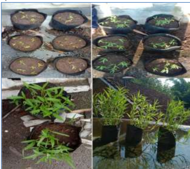
Figure 1. Plant Growth of Ipomea reptanas

Figure 2 shows that giving 7.5 grams of MSG added to 200 mL of rice washing water showed better plant growth from week to week (for 6 weeks) compared to giving 5 grams of MSG combined with 200 mL of rice washing water and control treatment. And at the end of the observation, namely at 6 weeks of age, the treatment of giving MSG with a combination of rice water washing showed higher results compared to the control. This shows that MSG and rice washing water have an effect on the high vegetative growth of Ipomea reptanas .