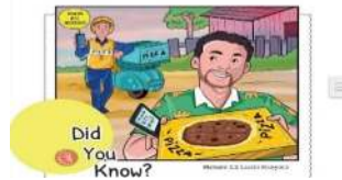
Fig. 6. Two men as food delivery people and food orderers

The visual image on page 57 is a description of the character's work and activities. The image shows two men in a situation illustrating their work roles and activities. One acts as a food delivery person, while the other acts as a food orderer. Food delivery personnel appear professional and alert, reflecting responsibility and diligence in their work. On the other hand, food orderers show independence and are busy in their daily lives, which makes them choose delivery services to fulfill their food needs. This picture depicts gender roles in the context of work and daily activities, showing that men are involved in various aspects of life, both in work that requires high mobility and in home life as consumers of services. This shows a balanced and dynamic representation of gender roles in modern society.