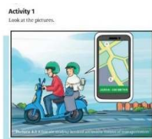
Fig. 8. shows a man working as an online driver and a female student as his passenger

The visual image on page 58 is a descriptive image showing two men working as cashiers and several students as shoppers, depicting representations of work and activities that challenge traditional gender stereotypes. Cashiering, which is often considered a female-dominated job, is in this context depicted as male. This shows that work roles are not limited by gender, and men can also fill roles previously considered more suitable for women. Students as buyers add the context that shopping activities are part of everyday life involving all genders, and there is no exclusivity in this activity. This depiction shows that work and daily activities should not be limited by gender stereotypes and that every individual, regardless of gender, can participate in a variety of work roles and activities. Blumberg's (2007) research shows that gender inequality in textbooks often reinforces existing stereotypes. However, by featuring men as cashiers, these textbooks offer more inclusive representation and teach students that jobs do not have to be gendered. Likewise et al., (2007) emphasized the importance of balanced representation in textbooks to inspire students to see various career possibilities without being bound by gender boundaries.