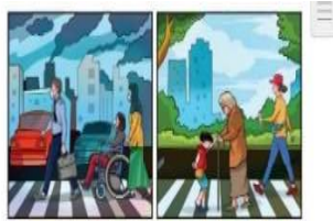
Fig. 4. a man going to work and exercising while a woman takes care of someone

The visual image on page 13 depicts gender social roles, the image shows several residents beautifying their village, there are two women and six men who work together in this activity. The men were seen busy doing heavy physical work such as repairing roads and planting trees. They use heavy equipment and do activities that require physical strength. Meanwhile, the two women in the photo appear to play a role in lighter but still important activities, such as arranging flowers in the garden and cleaning the surrounding area. This depiction reflects social roles that are often associated with gender, where men are associated with work that requires physical strength and technical skills, while women tend to do work that is more related to aesthetics and environmental cleanliness. However, the participation of both genders in this activity shows cooperation and joint contribution to the progress of their village. These roles, although still depicting some gender stereotypes, also show that every member of society has a valuable contribution to make, regardless of gender. To achieve a more inclusive and balanced representation, it is important to show that women are also capable of doing heavy physical work and men can also contribute to the aesthetics and cleanliness of the environment, so that in the first visual image they are categorized as social roles that are shared gender roles.