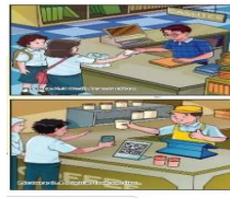
Fig. 7. Men working as cashiers

The visual image on page 57 is a description of the character's work and activities. The image shows two men in a situation illustrating their work roles and activities. One acts as a food delivery person, while the other acts as a food orderer. Food delivery personnel appear professional and alert, reflecting responsibility and diligence in their work. On the other hand, food orderers show independence and are busy in their daily lives, which makes them choose delivery services to fulfill their food needs. This picture depicts gender roles in the context of work and daily activities, showing that men are involved in various aspects of life, both in work that requires high mobility and in home life as consumers of services. This shows a balanced and dynamic representation of gender roles in modern society.