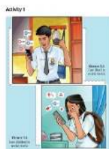
Fig. 11. the differences between men and women in using social media

The visual image on page 89 depicts the presentation of gender roles regarding the use of technology. The image shows two women making a transaction using electronic payments, which reflects the use of technology in everyday life. In the context of the presentation of the use of technology in textbooks, this picture shows that women are also active and skilled in utilizing modern technology for various purposes. This is a positive step in depicting gender equality, where women are not only technology users to carry out administrative or domestic tasks, but also as main actors in digital financial transactions. The depiction of women involved in the use of advanced technology, such as electronic payments, helps challenge traditional stereotypes that often associate men with leading roles in technology. According to research by Blumberg (2007), balanced and inclusive representation in textbooks can increase girls' interest and confidence in technology. By featuring women who actively use technology, textbooks can provide positive and realistic examples that support gender equality and encourage more women to get involved in the fields of technology and innovation.