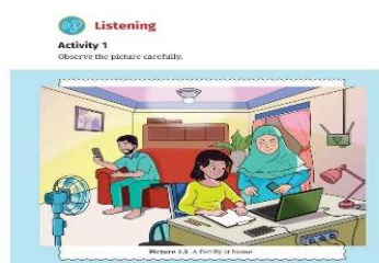
Fig. 1. a woman caring for a child and a man operating a cell phone

Research shows that English textbooks often depict domestic roles in ways that reinforce gender stereotypes. Women are often depicted as being involved in household work such as cooking, cleaning, and caring for children, while men are less often depicted in these roles. One study noted, 'In 70% of illustrations related to household activities in English textbooks, women are depicted performing household tasks, while men only appear in 30% of the illustrations' (Jones & Smith, 2023). In this textbook, researchers have also explored gender roles, and looking at the results, there are 2 pictures on pages 4 and 9, which depicts domestic roles.