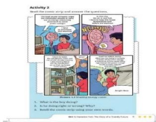
Fig. 2. a woman advising her child or the same as taking care of her child

The visual image on page 4, shows a family at home. A mother wearing a green hijab was standing near her daughter who was sitting at the study table writing in a notebook and laptop, to teach her daughter to do her assignments, while her father was sitting on a red sofa while using his cell phone, looking relaxed and comfortable. The woman appears to be playing the role of teacher or caregiver in helping with the child's education. On the other hand, a man is sitting on a sofa using a cell phone, indicating a more casual or non-domestic role in the situation. This shows that in these families, the tasks of children's education and household work are mostly carried out by women, while men do not appear to be directly involved in these activities. This division of roles reflects gender stereotypes that are often found in many societies, where women are more often involved in domestic tasks, while men tend to be more involved in activities that are personal or outside of household responsibilities.