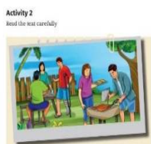
Fig. 5. Men and women cooking meat together

The visual image on page 31 depicts the social roles of gender in two different situations. In the picture on the left, you can see a man wearing a suit and carrying a bag walking at a fast pace on a street full of air pollution. Behind her, a woman wearing a headscarf pushes a child sitting in a wheelchair, showing the role of women in providing care and support in an unhealthy environment. In the image on the right, the situation changes to a cleaner one with a bright blue sky. A small child helps a grandmother cross the street, while a young man walks beside them. Here the social role of women as protectors and helpers is explained clearly, while the grandmother who is helped shows the role of women who are vulnerable and need support. The picture highlights how social gender roles are often depicted as not conforming to traditional stereotypes, where women should act as caregivers and men as protectors, but also as shows the care and empathy required in society. However, in this image the role of protector and empathy is directed at women, so that social roles are classified as monopolized by women.