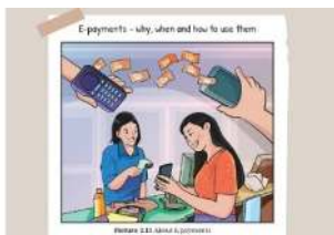
Fig. 10. two women making a transaction using E-payments

The visual image on page 89 depicts the presentation of gender roles regarding the use of technology. The image shows two women making a transaction using electronic payments, which reflects the use of technology in everyday life. In the context of the presentation of the use of technology in textbooks, this picture shows that women are also active and skilled in utilizing modern technology for various purposes. This is a positive step in depicting gender equality, where women are not only technology users to carry out administrative or domestic tasks, but also as main actors in digital financial transactions. The depiction of women involved in the use of advanced technology, such as electronic payments, helps challenge traditional stereotypes that often associate men with leading roles in technology. According to research by Blumberg (2007), balanced and inclusive representation in textbooks can increase girls' interest and confidence in technology. By featuring women who actively use technology, textbooks can provide positive and realistic examples that support gender equality and encourage more women to get involved in the fields of technology and innovation.